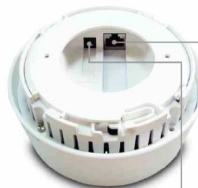
DC-inlet for Power Ethernet Port for RJ-45 cable