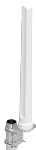
OMNI-414, mounted using the provided 316 Stainless Steel L-bracket