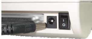
Fig. 7. Connect the power adapter to the printer.