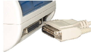
Fig. 5. Connect 25-pin cable to the printer.