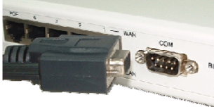
Fig. 3. Connect Y-cable to HotSpot Gateway serial port.