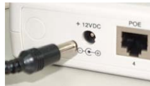
Fig. 8. Connect the power adapter to the HotSpot Gateway.