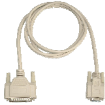
Fig. 4. Printer cable