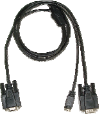
Fig. 1. Y-cable