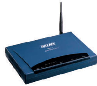
▲ myGuard 7500GL