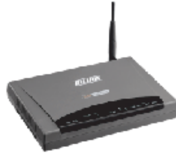
▲ BiPAC 7402VGO