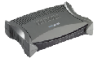
▲ BiPAC 7402R2

Billion's BiPAC 7402R2 is an enhanced 4-port VPN Firewall router designed for users who need to access to corporate networks or a remote VPN to enjoy secure, smooth, and express-speed Internet access. It supports 16 IPSec Virtual Private Network (VPN) tunnels with powerful 3DES accelerator, enabling users to securely connect multiple computers over the public Internet. With latest ADSL2/2+ technology, faster downstream data rate goes up to 24Mbps. The powerful Quality of Service feature integrated makes the device a perfect mate for users to benefit from traffic prioritization and bandwidth management. The BiPAC 7402R2 is truly a fantastic solution for SOHO and Office users to receive greater value and business productivity.